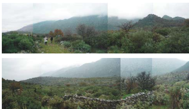
Figure 4: The existing situation of the area.

In the natural environment beyond the ecological consciousness and awareness, the materials as well as the ways used for constructions are also considered important. Materials with light colours friendly to the environment have to