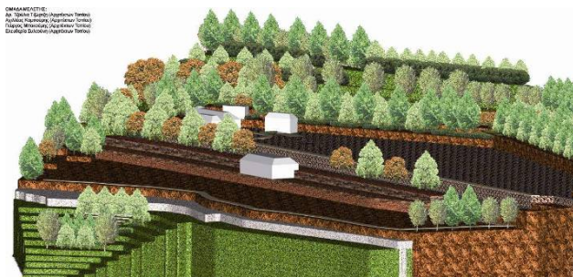
Figure 5: 3D Model of the proposed Configuration in the Unit.

The design, in terms of functionality of the site is summarized below. A traffic clear network of footpaths will connect the various parts. Alternative forms of operations so that different areas can be used both ways, through individual and organized activities, will be developed includ-