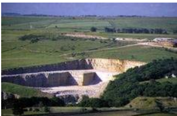
Figure 1: Darlton Quarry.

In Darlton quarry several uneven slopes in terms of height were created. The slopes were developed in such a way as to act as a link with the boundaries of the quarry. The elements of the area outside the quarry were extended to the inner part of the restoration area to enable better interaction. The type, colour and layout of the area play a very important role especially when the site is visible from long distances.