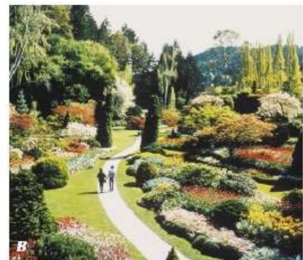
Figure 2a and b: The Butchart Gardens in British Columbia in Canada.