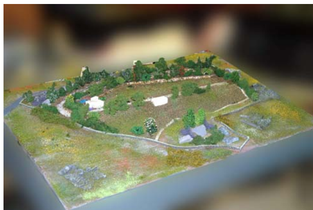
Figure 6: Photograph of the model with the proposed configuration.

ing: Aesthetical organization that reflects the character of the area, Use of vegetation as a main element, Flexibility of the space with the possibility of carrying out social open air activities (exhibitions, performances, rallies), Visual and functional complexity of each area to provide the necessary wealth. Finally, all provisions in the light of the Environmental Planning and Principles of Landscape Architecture to protect and enhance the cultural and natural landscape of the region will be considered.